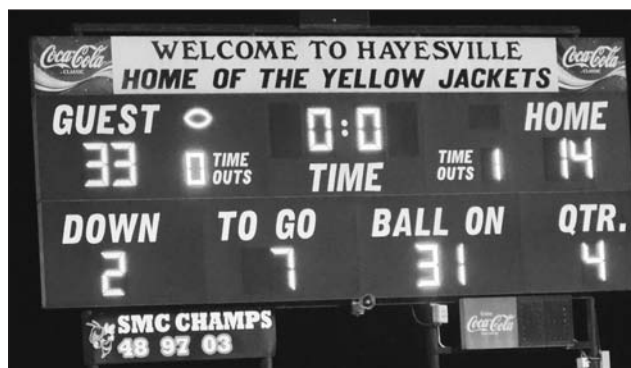
No caption necessary. This picture says it all.

With 1st-and-goal at the 5-yard line, Hayesville found pay dirt with a pair of running