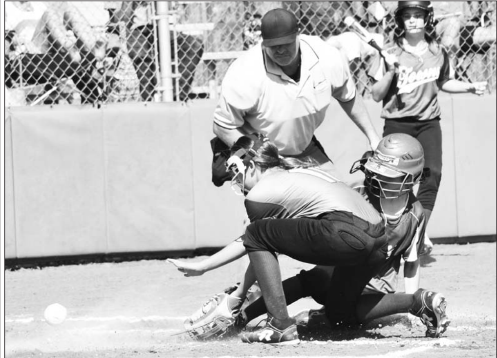
Safe at home! Towns County Middle School's softball team swept a home doubleheader from Hebron Christian last week.