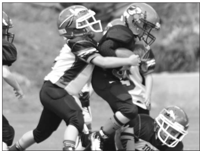
Towns County youth football in action.

Moving on to the Mites, they suffered an 18-0 defeat at