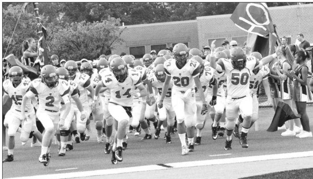
The Towns County Indians take the field prior to their victory at Hayesville, NC.

flagged seven times in the first quarter alone, and drew 10 flags total in the first half.